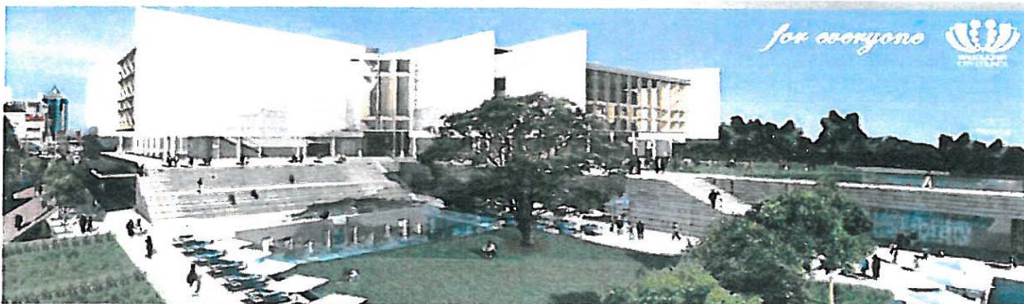
An artist's impression of the new Chatswood Civic Place

The project consists of a 400 car underground carpark , Public Library, Civic Hall, 500 seat Theatre, 1000 seat Concert Hall, Retail Shops ,Cafes & Restaurants