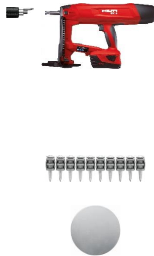
2. Battery actuated direct fastening