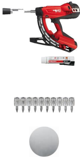
1. Gas actuated direct fastening